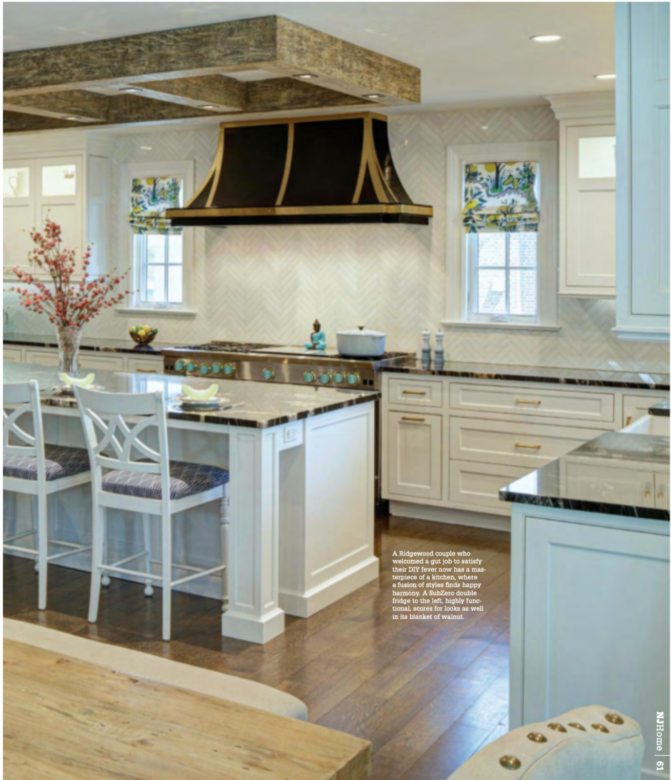
A Ridgewood couple who welcomed a gut job to satisfy their DIY fever now has a masterpiece of a kitchen, where a fusion of styles finds happy harmony. A SubZero double fridge to the left, highly functional, scores for looks as well in its blanket of walnut.